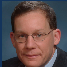
Charles M. Lieber Joshua & Beth Friedman University Professor Department of Chemistry and Chemical Biology Harvard University